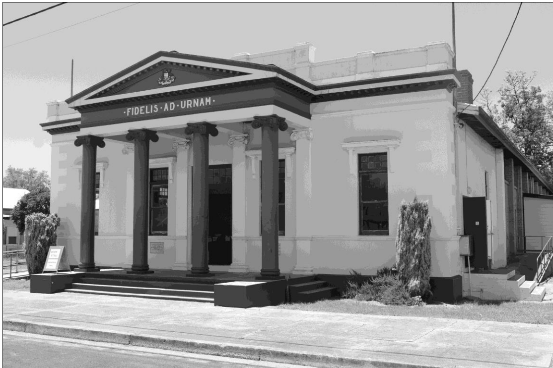
Baradine Memorial Hall